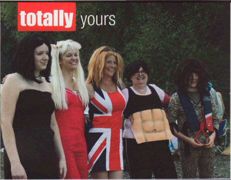
Above and Below: Girls finally win the battle of the sexes. Linden Homes Thames Valley entered an all boys and an all girls team into the Eton Excelsior Rowing Club Regatta to determine once and for all who the superior sex is. The Jackson 5 and the Spice Girls both put up a spectacular fight but ultimately girl power came out on top. Better luck next year lads.