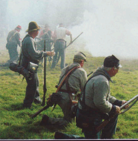
It's not ye olden days, it's a reenactment. Cliveden House recently held its ever popular National Trust's Blast from the Past weekend. Apparently it was a blast.